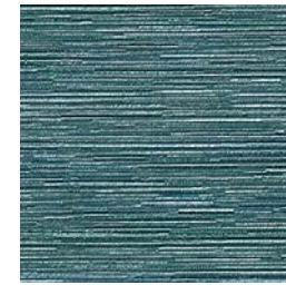
DN2-KRA-07 Lily Pond