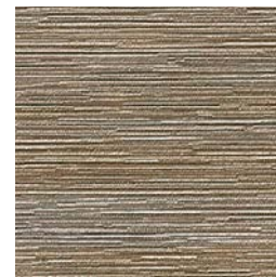
DN2-KRA-16 Guided Taupe