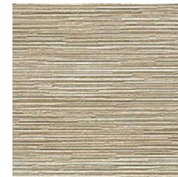
DN2-KRA-12 Sand Garden