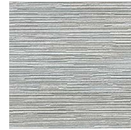
DN2-KRA-02 Snow Moon