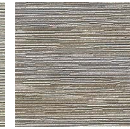
DN2-KRA-05 Tranquility Stone