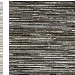
DN2-KRA-10 Black Sand