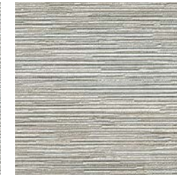
DN2-KRA-03 Pacific Log