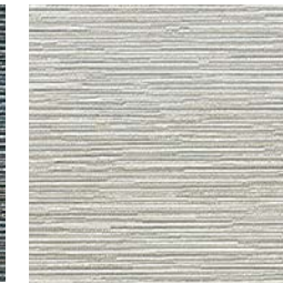
DN2-KRA-09 Shoji White