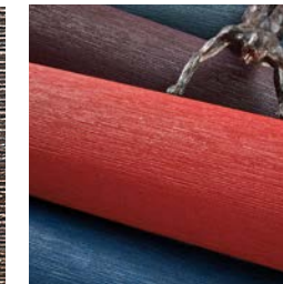
FOR SIMILAR TEXTURES CLICK HERE

Type II 24 oz | Width: 52"/54" | Backing: Non-Woven | Match: Non-Reversible Straight Across Match Repeat 52"H x 24"V | Fire Rating: Class A | Flame Spread: 20 | Smoke Development: 10