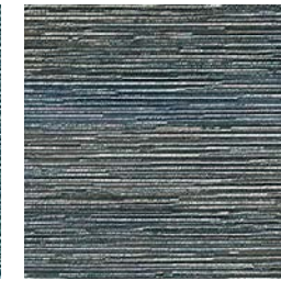
DN2-KRA-08 Indigo Wash