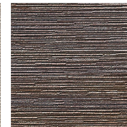
DN2-KRA-18 Raw Amethyst