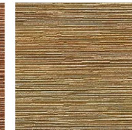
DN2-KRA-15 Koi Gold